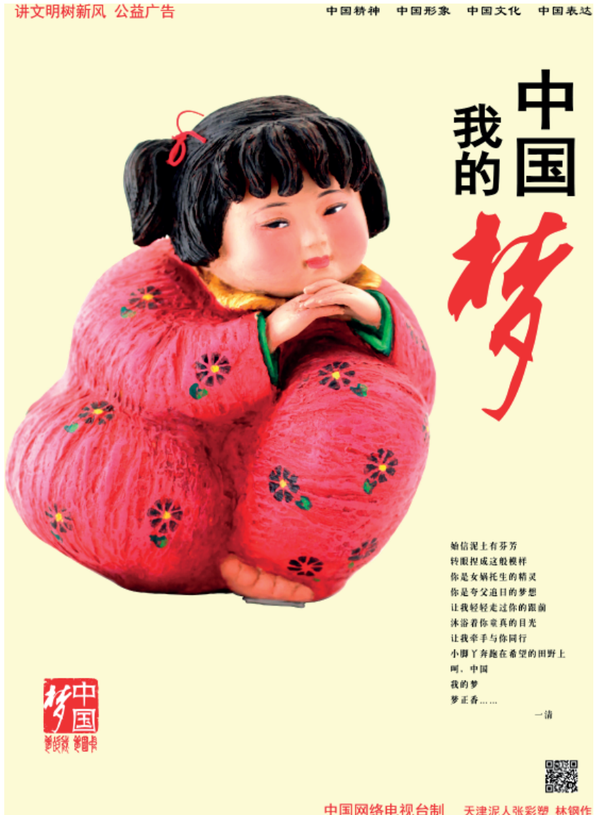
Figure 5.4 Designer: Public Service Advertising Art Committee; figurine designed by Lin Gang. Title: Wode meng (The Chinese Dream is my dream). Publisher: China Internet Television Station. Date of publication: 2013. No print number. Available on website of the Civilization Office under the CCP Central Committee: http://www.wenming.cn/jwmsxf_294/zggygg/pml/zgmxl/201309/t20130930_1501267.shtml