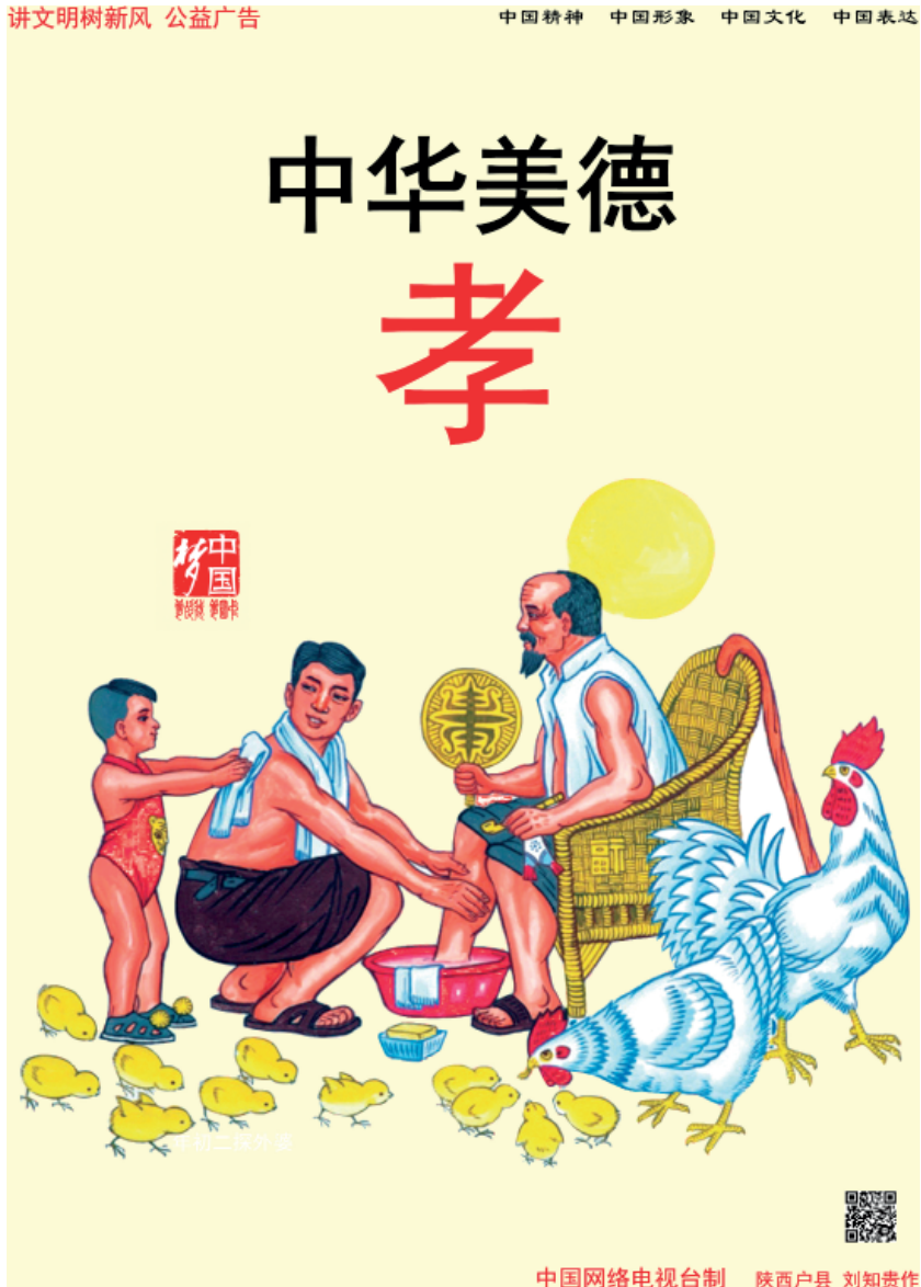
Figure 5.5 Designer: Public Service Advertising Art Committee; image designed by Liu Zhigui. Title: Zhonghua meide – Xiao (Chinese virtue – filial piety). Publisher: China Internet Television Station. Date of publication: 2013. No print number. Available online on website of the Civilization Office under the CCP Central Committee http://www.wenming.cn/jwmsxf_294/zggygg/pml/ctmdxl/201309/t20130929_1500525.shtml