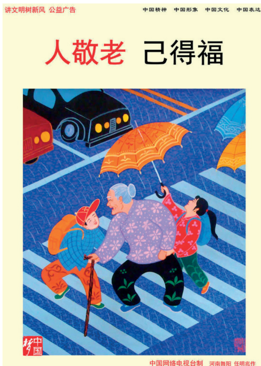
Figure 5.6 Designer: Public Service Advertising Art Committee; image designed by Ren Mingzhao. Title: Ren jing lao ji de fu (The people honour the old for their own happiness). Publisher: China Internet Television Station. Date of publication: 2013. No print number. Available online on website of the Civilization Office under the CCP Central Committee http://www.wenming.cn/jwmsxf_294/zggygg/pml/tmdxl/201309/t20130929_1500644.shtml