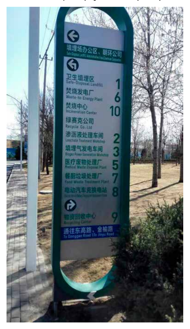
Illustration 7.1 Signpost showing directions to the various facilities at the Beijing Municipal Chaoyang Circular Economy Industry Park