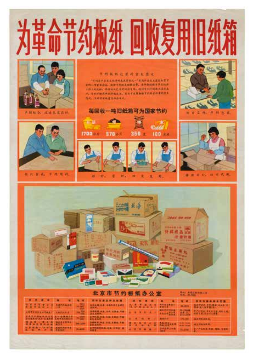
Illustration 1.4 Beijing Municipal Office for Saving Paper (北京市节约板纸办公室). 'Economize on paper for the revolution, collect and re-use old paper boxes' ('为革命节约板纸回收复用旧纸箱')

Beijing Municipal Office for Saving Paper, date of publication unknown, circulation unknown IISH/Stefan R. Landsberger Collection.