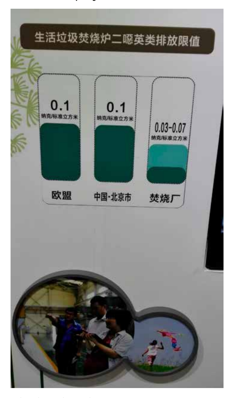
13 March 2017