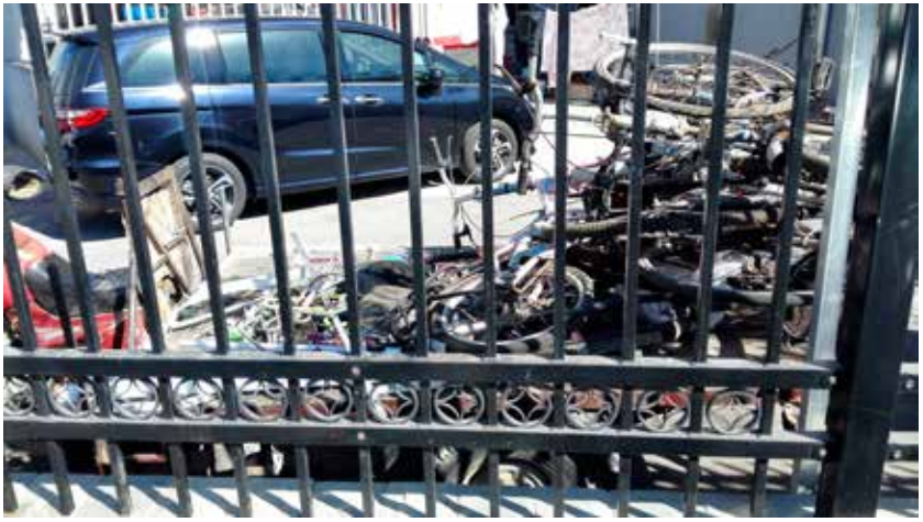
Illustration 4.4 Discarded bicycles awaiting transport at a Haidian District scrap collection point