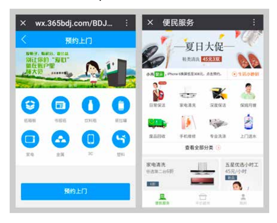
Illustration 2.1 Screenshots by the author of the Bangdaojia (left, Incom) and Zaishenghuo (right, Anewliving) apps showing some of their services. May 2018

seemed to have disappeared remained unclear. More and more frequently, information circulated that Taoqibao's board of directors had vanished, taking the investors' money with them; according to people familiar with Beijing business practices, this has happened often (Interviews, 2017). A year later, in 2018, the Taoqibao website has ceased operations and been taken over by a company called Men's Heaven (男人天堂); the site is unresponsive.