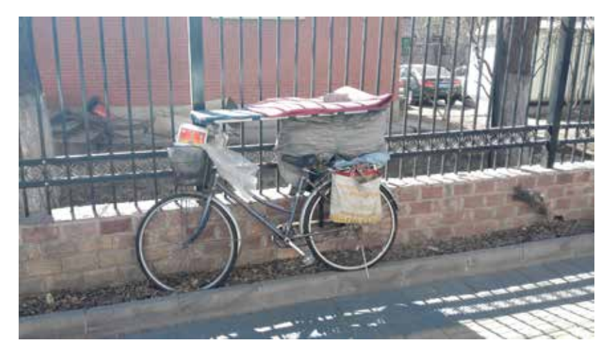
Illustration 4.3 A bicycle loaded with collected junk, Haidian District