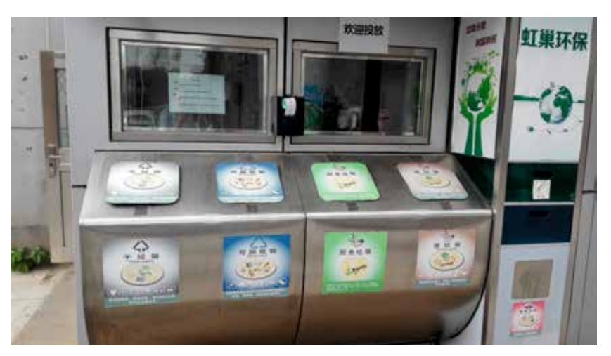
Illustration 3.4 Front view of a Red Nest in a Shunyi District residential community, designed and operated by the Hong Chao (Red Nest) Enviro-Tech Company. Note the RFID tag dispenser