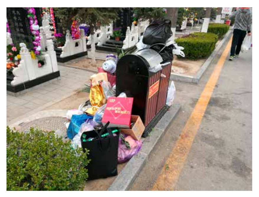
Illustration 5.1 Overflowing waste bins at a Beijing cemetery during the 2017 Qingming Festival, or Tomb sweeping day