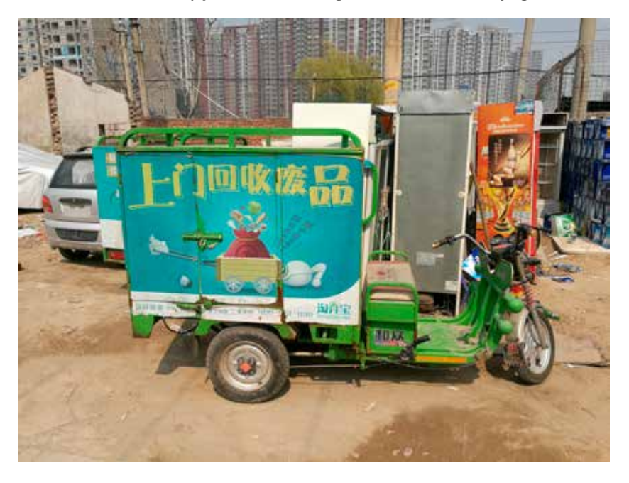
Illustration 2.3 A van operated by Taoqibao, at a Qianbajia waste collection point, formerly part of Henan Village, Haidian District, Beijing