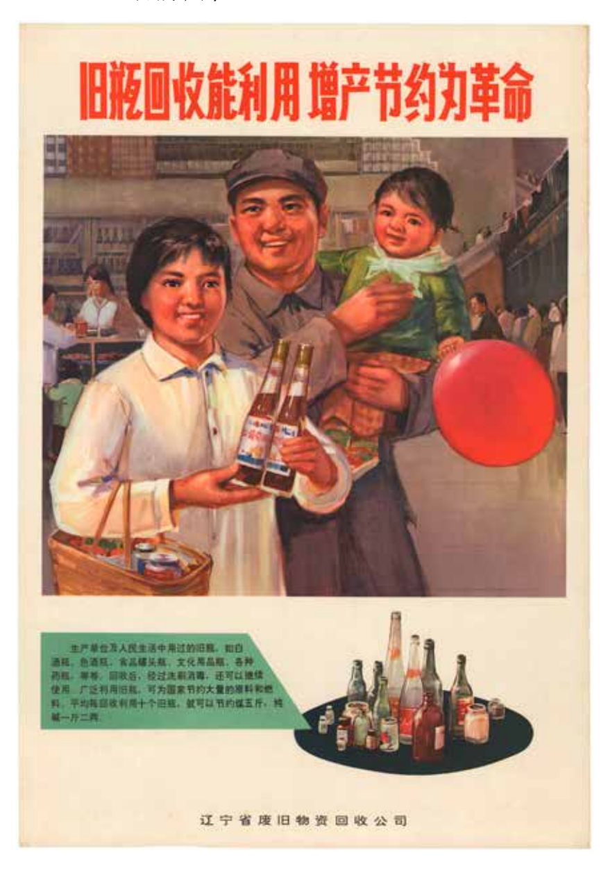
Illustration 1.2 Liaoning Old and Used Goods Collection Company (辽宁省废旧物资回收公司). 'Recycle old bottles to use them again, increase production and be thrifty for the revolution' ('旧瓶回收能利用增产节约为革命')

Liaoning Old and Used Goods Collection Company, 1960s?, circulation unknown IISH/Stefan R. Landsberger Collection.