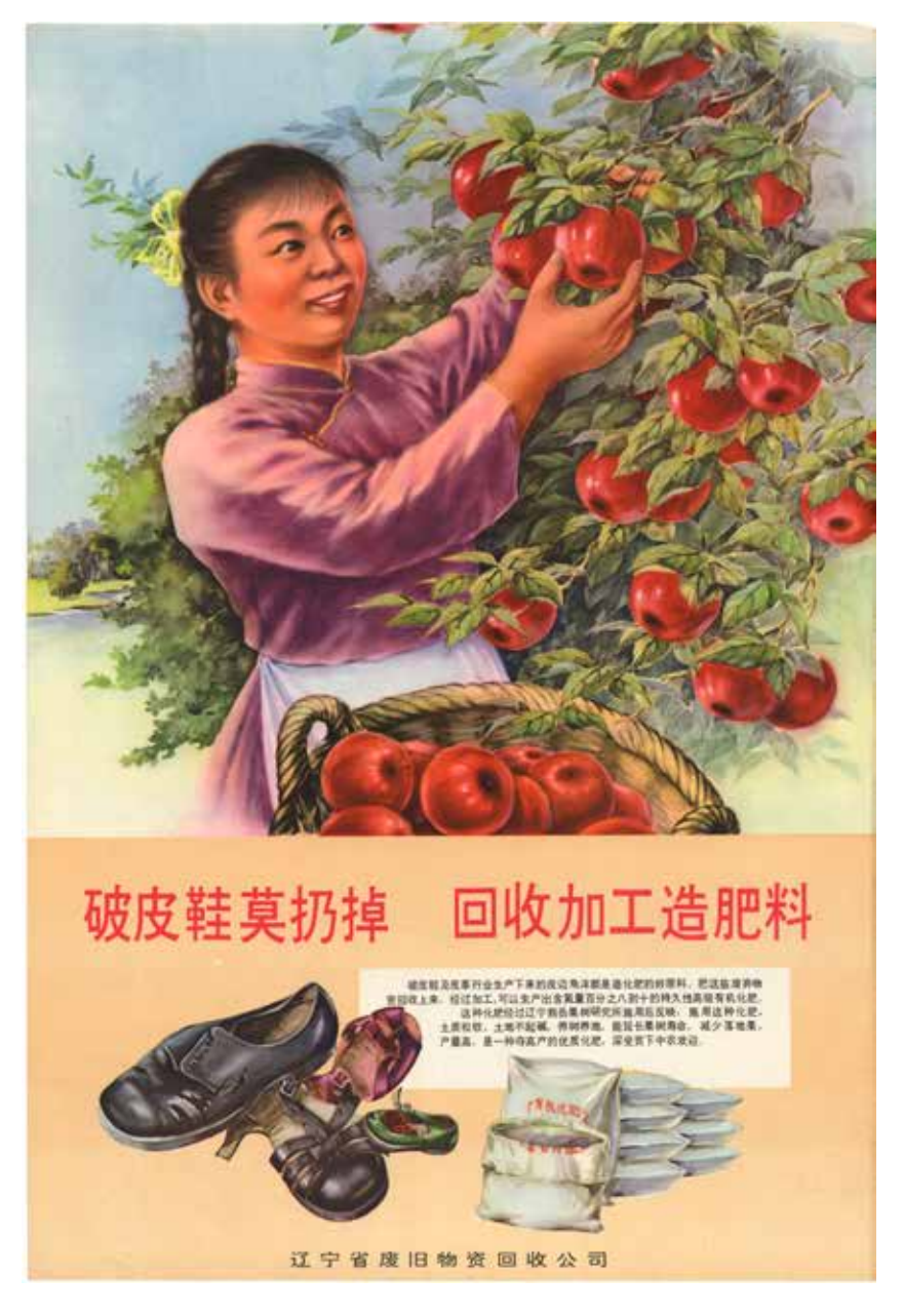
Illustration 1.1 Liaoning Old and Used Goods Collection Company (辽宁省废旧物 资回收公司). 'Don't throw away broken leather shoes, recycle them to turn them into fertilizer' ('破皮鞋莫扔掉回收加工造肥料')

Liaoning Old and Used Goods Collection Company, 1960s?, circulation unknown IISH/Stefan R. Landsberger Collection. Photo © International Institute of Social History