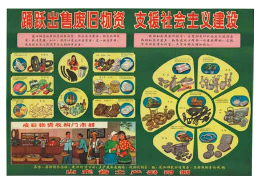
Illustration 1.3 Shandong Provincial Local Products Company (山东省土产公司). 'Eagerly sell old and useless materials to support the construction of socialism' ('踊跃出售废旧物资支援社会主义建设')

Shandong Provincial Local Products Company, 1960s?, circulation unknown IISH/Stefan R. Landsberger Collection.