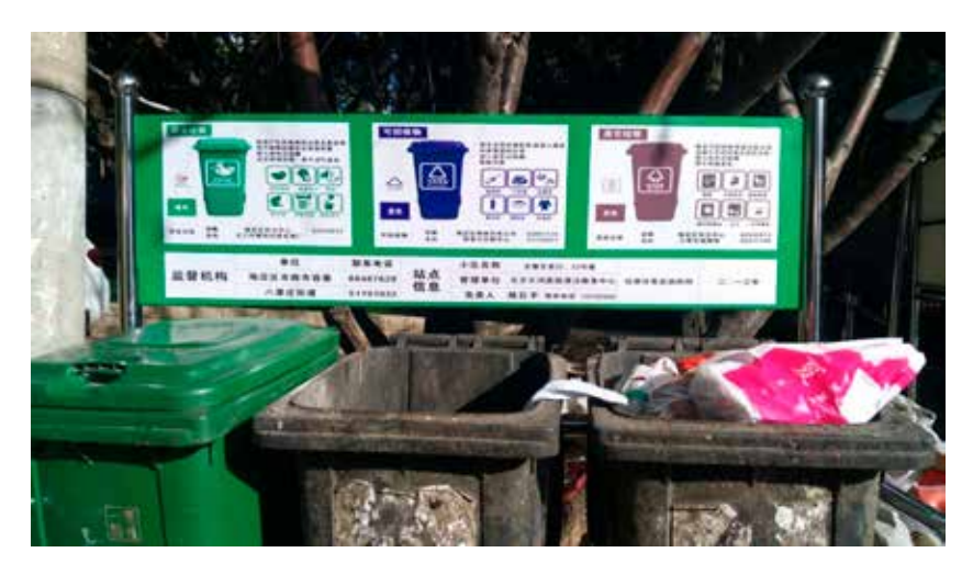
Illustration 3.1 Communal garbage bins on the grounds of a residential community. The sign indicates which garbage needs to go into which bin