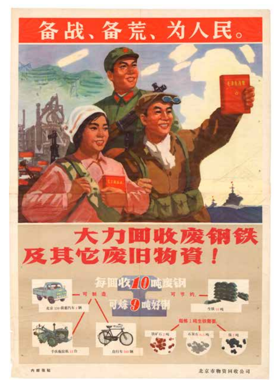
Illustration 1.5 Beijing Municipal Scrap Recycling Company (北京市物资回收公司). 'Strive to collect scrap metal and other waste materials!' ('大力回收废钢铁及其他废旧物资!')

Beijing Municipal Scrap Recycling Company, early 1970s, circulation unknown (internal use) IISH/Stefan R. Landsberger Collection. Photo © International Institute of Social History