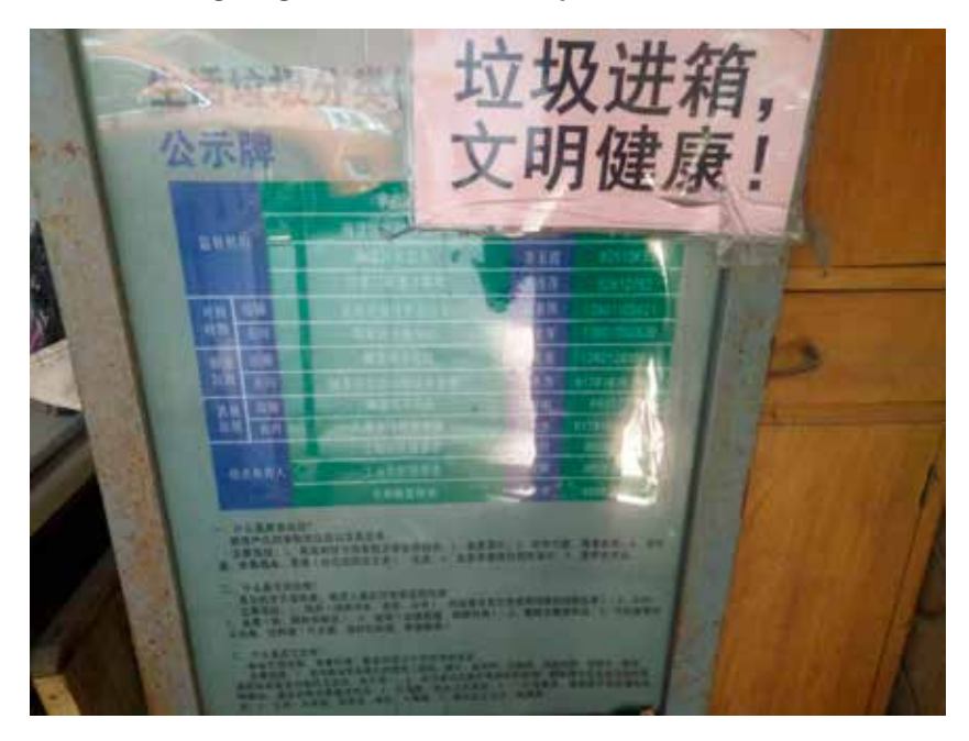
Illustration 3.2 A signboard put up in a residential community providing information on garbage classification and separation. The message stuck on the board urges people to dispose of their garbage in the bins, in order to promote civilization and health