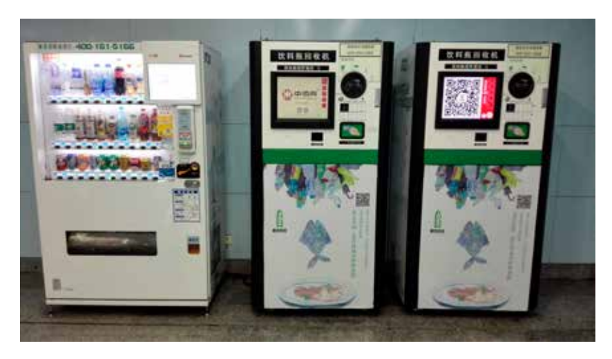
Illustration 2.2 Two RVMs operated by the Beijing Incom (Yingchuang) Resources Recovery Recycling Co. Ltd, at the Panjiayuan No. 10 Subway Station